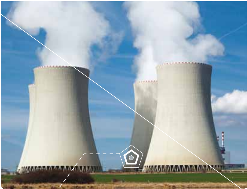
RESEARCH AND NUCLEAR