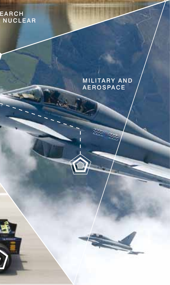
MILITARY AND AEROSPACE